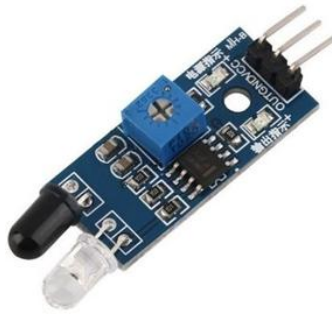
Fig 1. IR detector