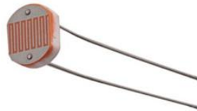
Fig. 2. Typical LDR Sensor

Most home appliances, outdoor lighting, and streetlights are normally operated and maintained manually. This is not only dangerous, but it also wastes energy due to staff negligence or unforeseeable events when turning this electrical equipment ON and OFF. Therefore, by using a light sensor, we can automatically shut off the loads based on the intensity of the daylight.