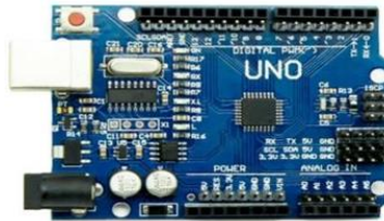
Figure 5 Arduino UNO Board

Arduino UNO is based on an ATmega328P microcontroller. It is easy to use compared to other boards, such as the Arduino Mega board, etc. The board consists of digital and analog Input/Output pins (I/O), shields, and other circuits.