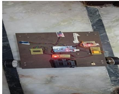
Fig 6: Result